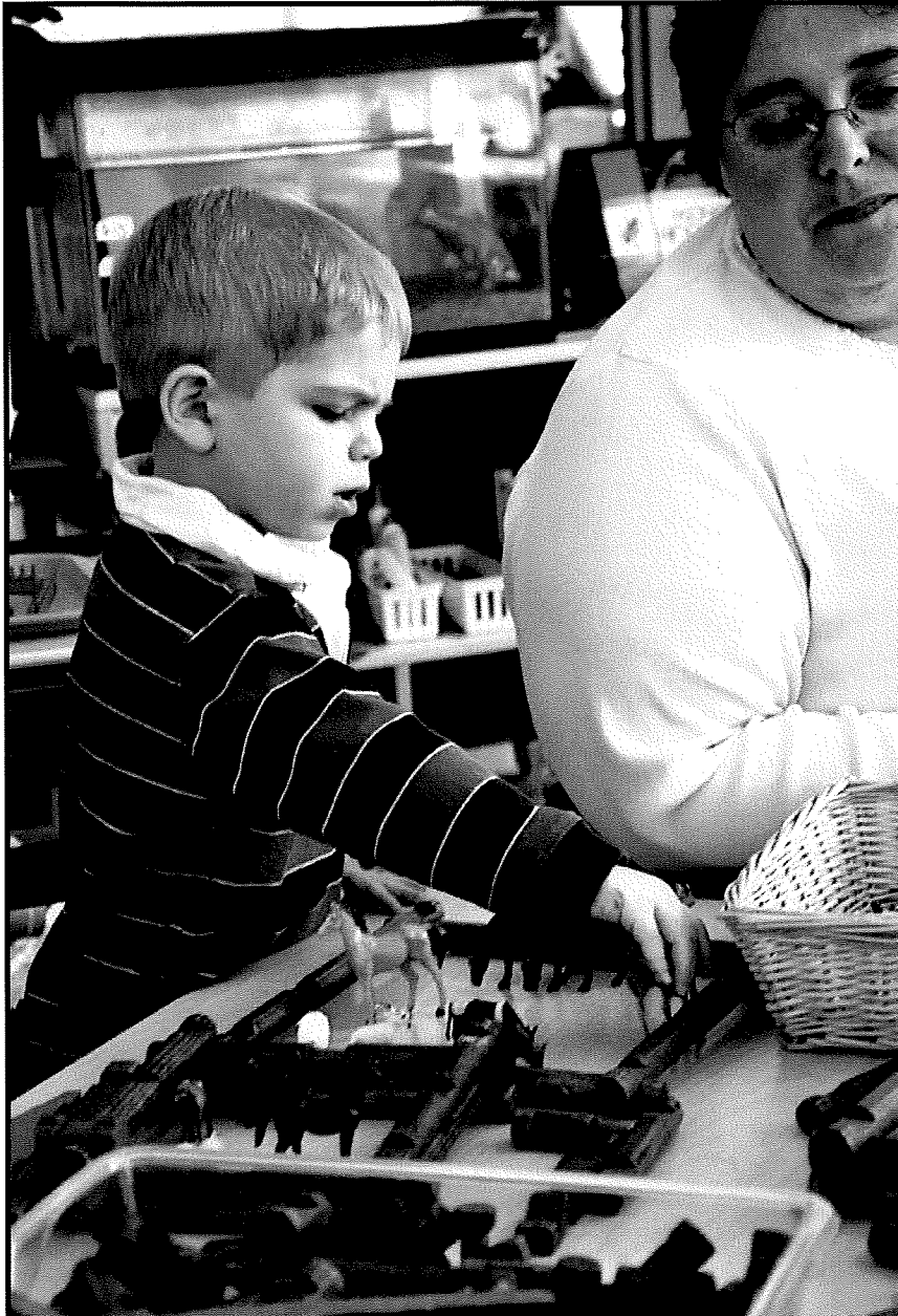
Subjects & Predicates

Provide all children with rich and varied opportunities to demonstrate their learning. Find methods that focus on understanding how children use the knowledge and skills they are learning within the context of everyday routines and activities.