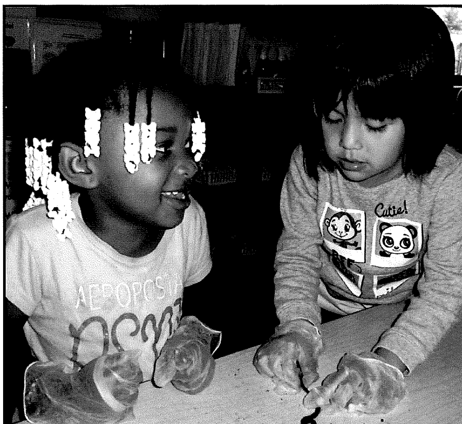
Subjects & Predicates

Some children learn better by listening, others learn better by seeing, still others learn better by doing. Most people, including children, learn best from a combination of all these approaches. The concept that learning is multisensory is built into every appropriate early childhood curriculum.